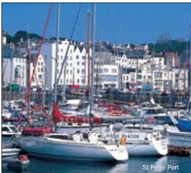
St Peter Port