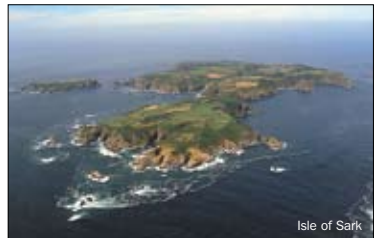
Isle of Sark